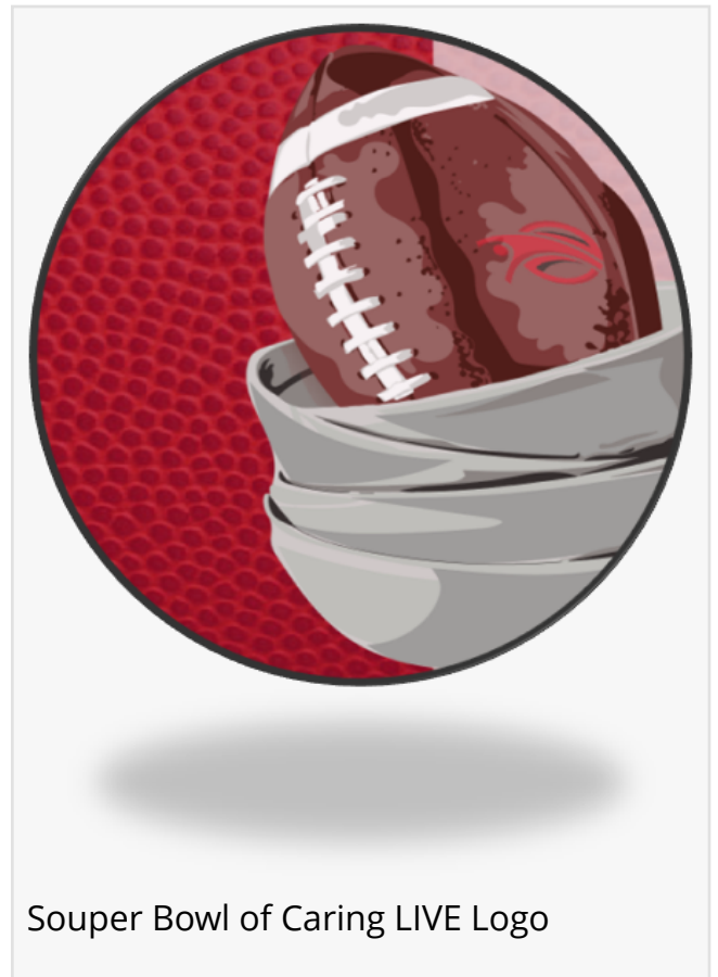
Souper Bowl of Caring LIVE Logo

Hope For The City is a leading nonprofit organization committed to positively impacting the Las