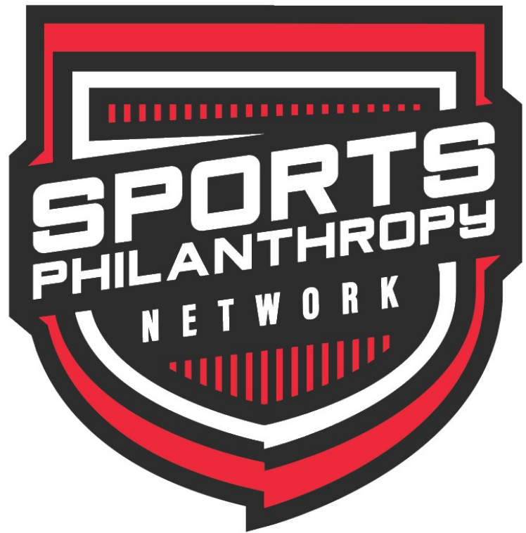
SPN Shield Logo