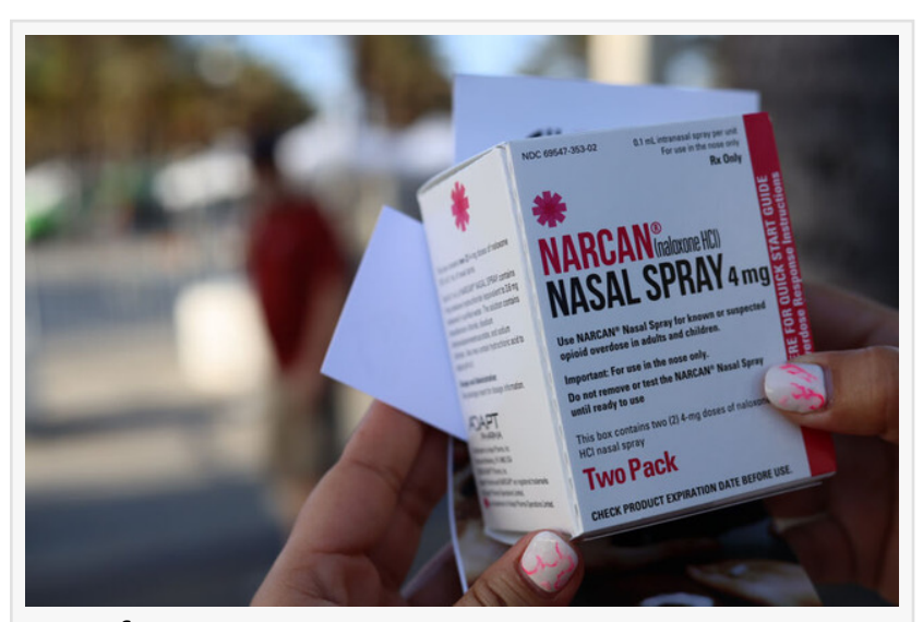
Box of Narcan Spray

DAVIE, FL, UNITED STATES, January 15, 2024 /EINPresswire.com/ -- In 2023, The Robin Foundation distributed over 5,000+ Narcan kits, which are approximately 10,000 + Narcan sprays. Because of these efforts, many lives, no doubt, were saved. Chris Cavallo cofounder stated, "The Narcan distribution program is only due to the