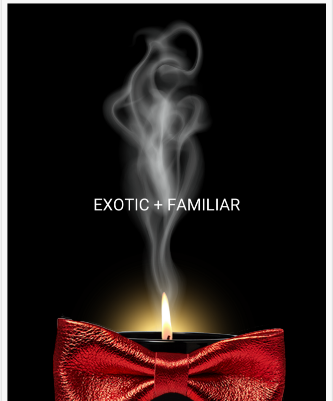
Bow & Tie Candles - Display 3