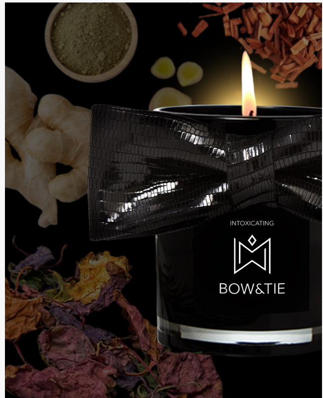
Bow & Tie Candles - Display