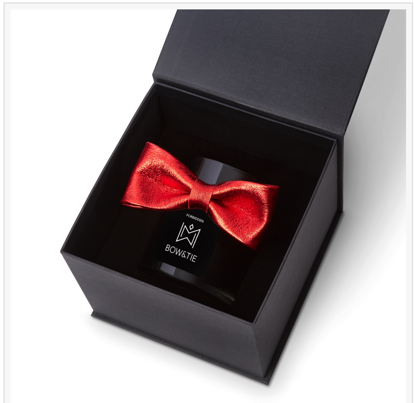
Bow & Tie Candles - Forbidden