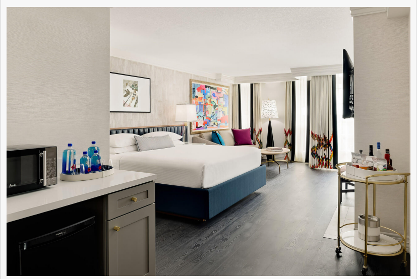
Indulge in the comfort of Le Parc Melrose's suites, where modern luxury and artistic flair create the perfect urban retreat for your day stay.

Elevate your day with a dip in Le Parc Melrose's rooftop pool, where sun-soaked luxury meets West Hollywood's skyline.