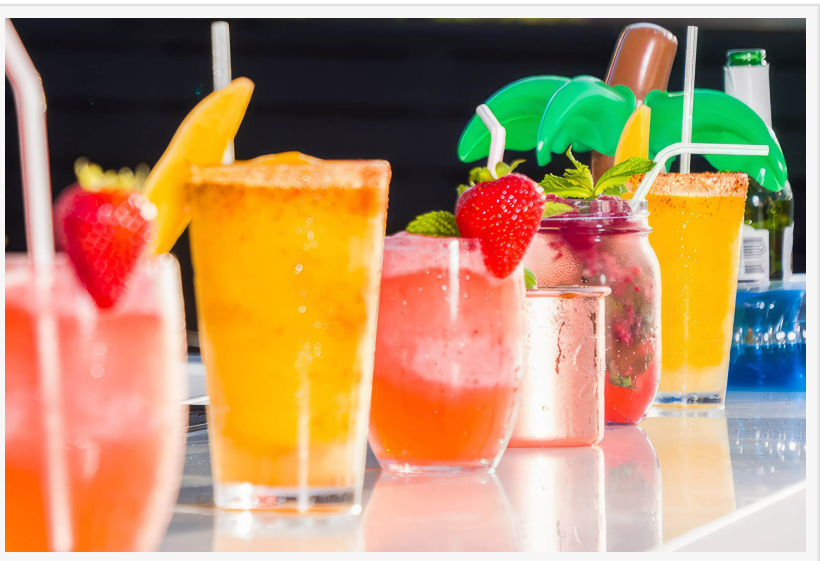
Sip and savor the taste of West Hollywood with Le Parc Melrose's handcrafted cocktails, a perfect toast to your luxurious day stay.