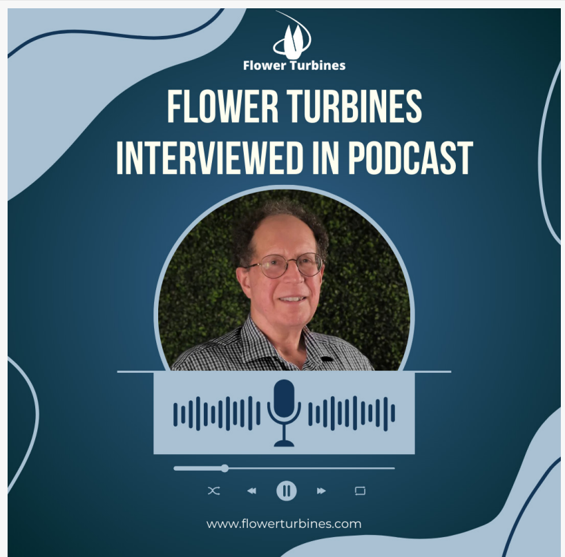
Flower Turbines on Podcast

aerodynamic innovations with beautiful design, low noise, and bird friendliness. Unlike other turbines, they make each other perform better when tightly packed together.