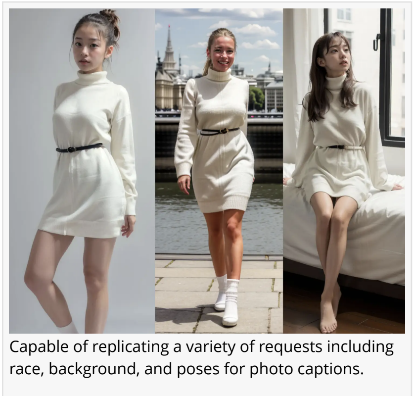
Capable of replicating a variety of requests including race, background, and poses for photo captions.

Initiate your journey to distinct brand creatives by simply uploading photographs of clothing items. The process begins with an initial consultation to understand the specific imagery goals. Following this, the upload of apparel photos enables the creation of high-quality model photos in as short a timeframe as one week.