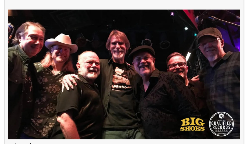
Big Shoes 2023