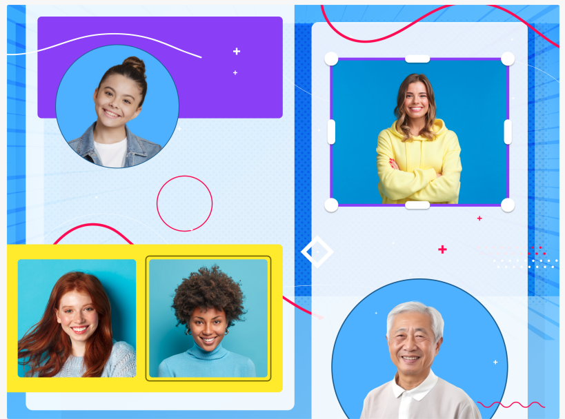
PeopleMaker synthetic model generator