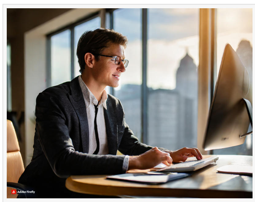
IT Support for Orlando

Dytech Group is also proud to maintain long-term partnerships with many prominent Orlando companies who