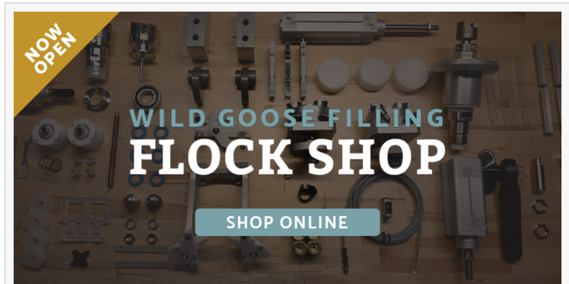
Wild Goose expands online Flock Shop e-commerce site

now offers nearly all spare parts for Wild Goose and Meheen™ packaging systems.