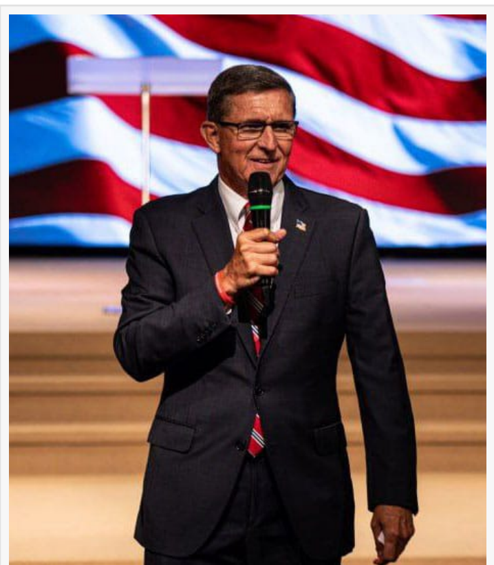
General Michael Flynn, National Security Advisor to Donald Trump, 45th President

General Flynn is a renowned leader in National Security who understands the “crisis of confidence” that poor leadership in our government has instilled in the hearts and minds of hard-working West Virginians. This lack of confidence and loss of faith in our elected leaders can only be corrected by electing true patriots that will put their country first.