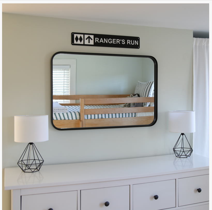
Custom Trail Signs for Ski House

"TRAPSKI's commitment to simplification and quality is exemplified in our new custom sign offering to the marketplace. Having some fun via sign personalization with high quality and long-lasting materials for a reasonable price means more value for our customers." said Sal DePino, CEO at TRAPSKI.