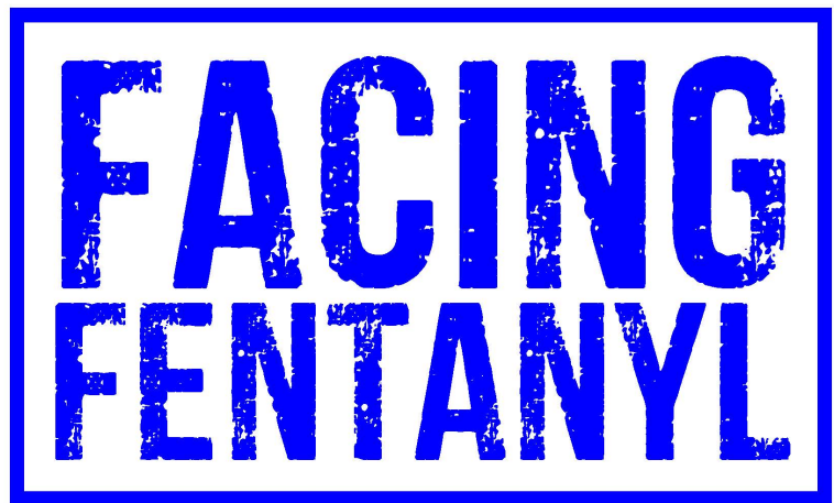
Facing Fentanyl Prevention and Awareness