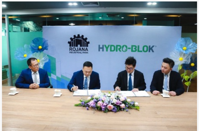
Rojana and Hydro-Blok signed the joint venture agreement.