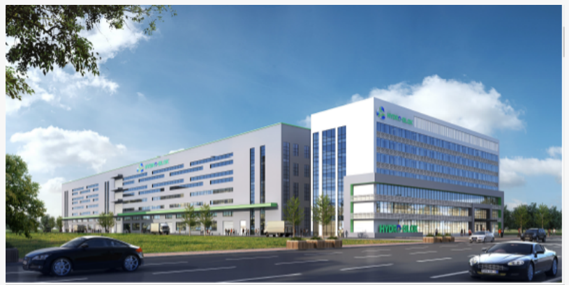
Hydro-Blok's China New Manufacturing Base Under Construction

With Rojana's joint venture, Hydro-Blok will open the door to the Japanese market with the assistance of Nippon Steel, which is Japan's largest steelmaker and the third-largest leading steel producer in the world. Nippon Steel is Rojana's second-largest shareholder.