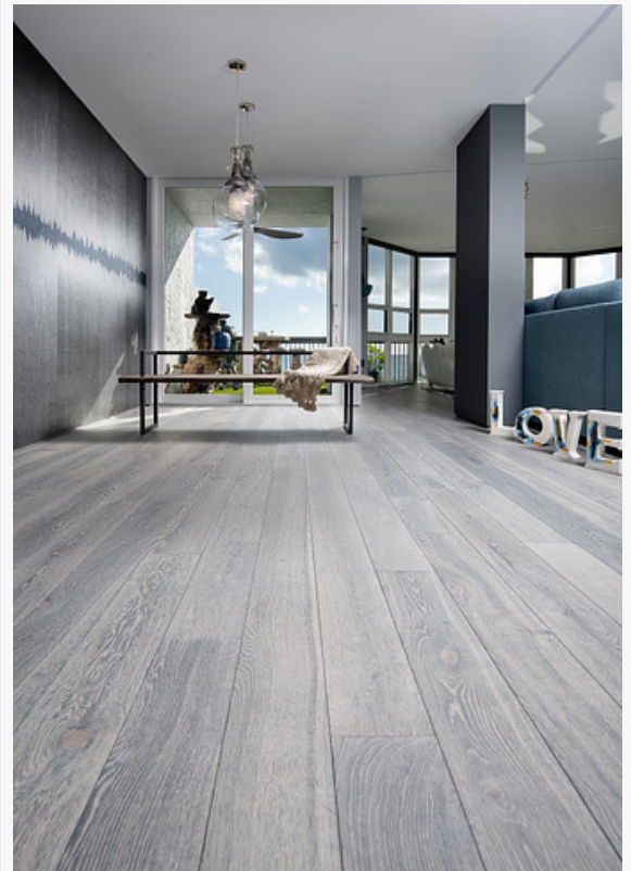
Interior Design Secrets Unveiled

Studies conducted by researchers from the Harvard T.H. Chan School of Public Health have shown that biophilic - or natural - elements in interior decor provide a restorative effect that