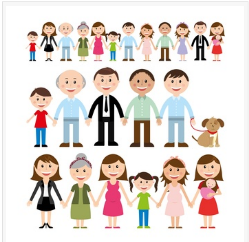
Earned Income Credit Qualifications