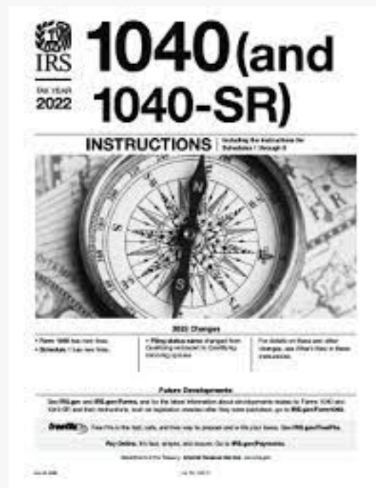
IRS Tax Form Instructions

This press release can be viewed online at: https://www.einpresswire.com/article/680059146 EIN Presswire's priority is source transparency. We do not allow opaque clients, and our editors try to be careful about weeding out false and misleading content. As a user, if you see something we have missed, please do bring it to our attention. Your help is welcome. EIN Presswire,