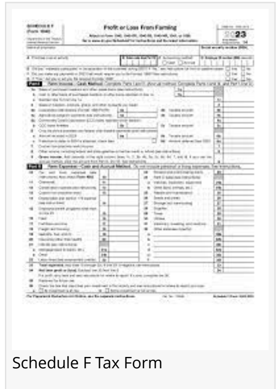
Schedule F Tax Form

Farmers and ranchers can also order the forms by mail by calling the IRS toll-free number.