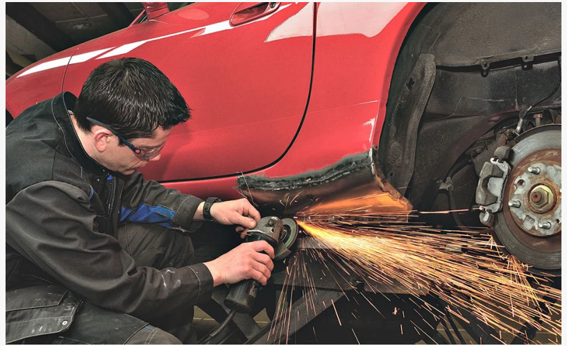
Don Hinds Ford, Inc. provides a wide selection of repair services to keep customers' vehicles in good condition.

The service center takes pride in using genuine Ford parts, emphasizing the quality and longevity