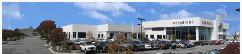
Don Hinds Ford, Inc. has been serving the greater Indianapolis area for over sixty years.