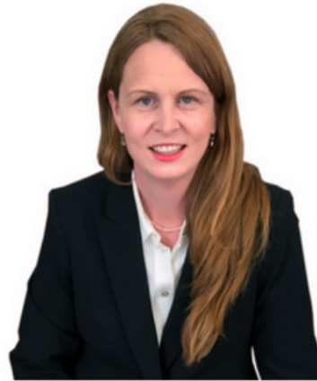
Dr. Catie Harris

Symptom Relief: Patients often report significant relief from symptoms such as hot flashes, night sweats, mood swings, fatigue, and more within just a few weeks of treatment.