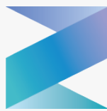
ZEF Energy Logo