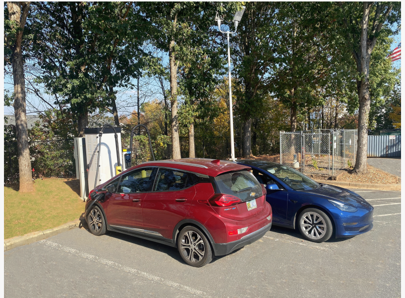
ZEF Energy Power-K Series (Kempower) Install in South Carolina