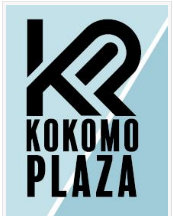
Kokomo Plaza Logo

- a 1,000 square foot retail space ideal for businesses seeking a dynamic and versatile space; and