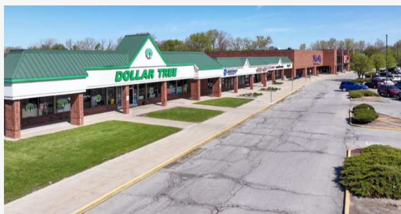
Kokomo Plaza Facade: A Captivating Entrance