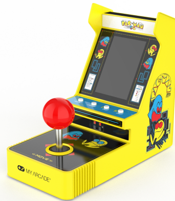
PAC-MAN Joystick Player

Stay tuned for exciting My Arcade® announcements on Instagram, Facebook, Twitter (X) and TikTok @MyArcadeRetro