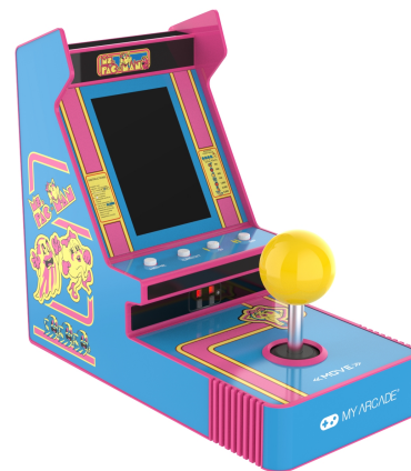
Ms.PAC-MAN Joystick Player