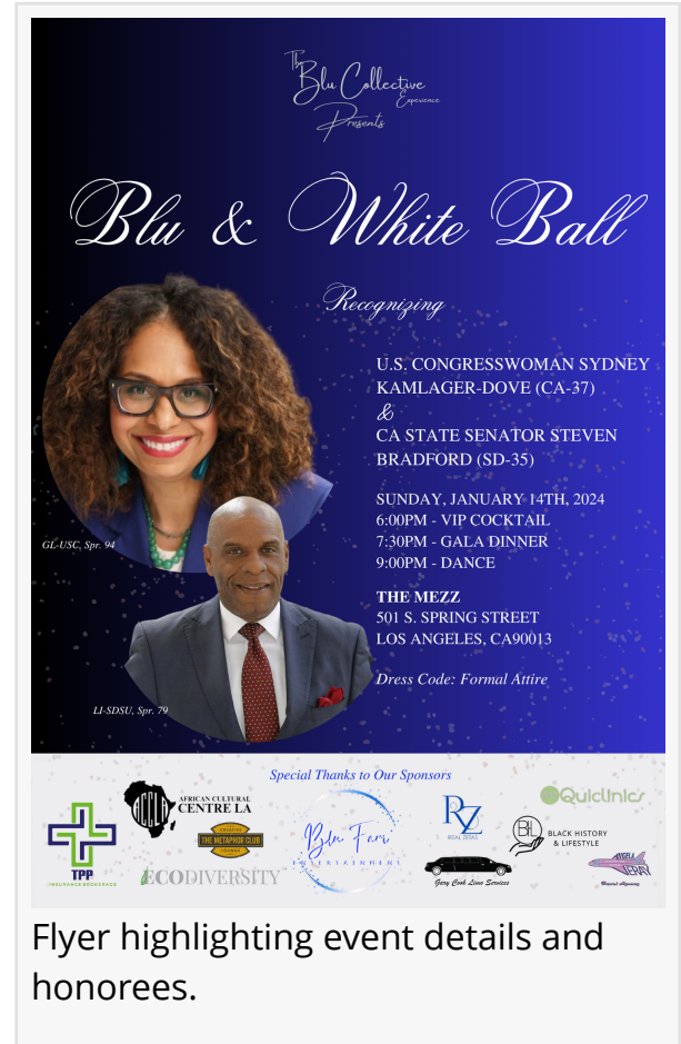
Flyer highlighting event details and honorees.

"I am incredibly honored to accept this recognition during the Blu Collective Experience Gala," stated Rep. Sydney Kamlager-Dove. "For me, being a Zeta was always about the Sisterhood. It has meant being part of a community that supports Finer Black women and amplifies their voices, needs, and resilience. Zetas are women of service, and every day in Congress, I am proud to advocate for the principles and movements that have defined Zeta Phi Beta Sorority, Inc. for 103 years. From my passion for advancing the arts in Congress to strengthening strategic U.S.-Africa ties and diplomacy, I continue to reflect on how being a Zeta has made a difference in my life. I was proud to introduce a resolution in the House congratulating and commending Zeta Phi Beta Sorority, Inc. on their years of service and sisterhood. Most of all, I deeply value how being a Zeta has meant leading with love, something I will continue to do in my work in public service."