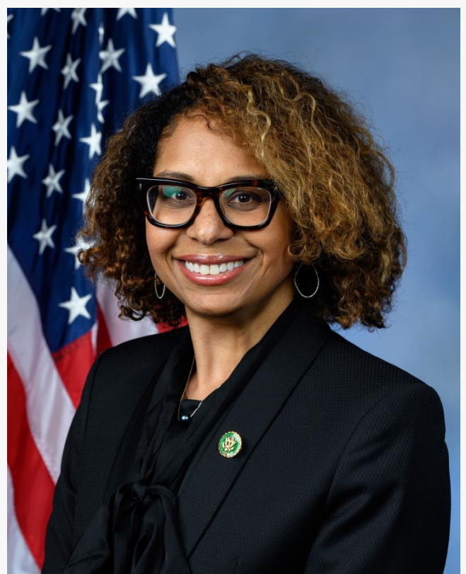
Official Congressional Headshot of Rep. Kamlager-Dove

provides for trained, community-led teams to respond to non-violent 911 calls – instead of police – making communities safer and saving lives. She also worked to establish the California Small Business COVID-19 Relief Grant Program to help small business stay afloat, coauthored the