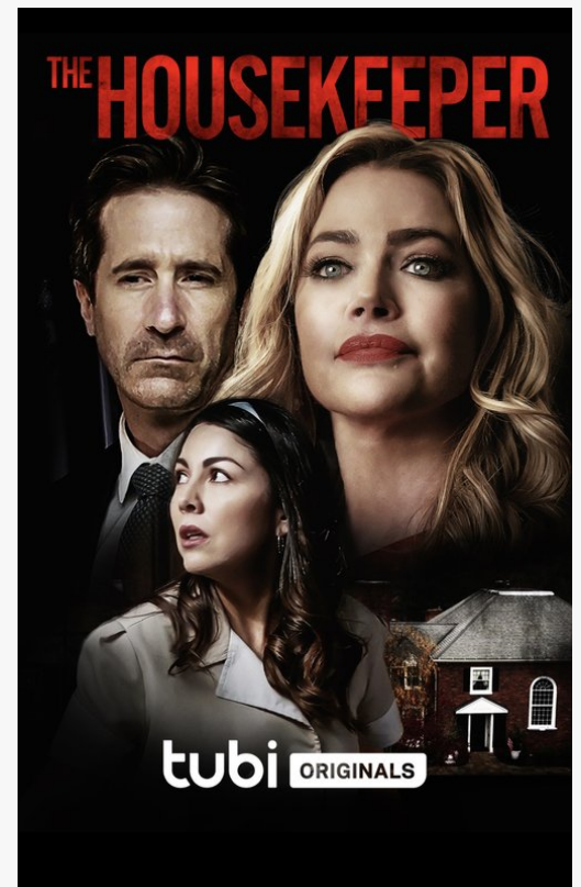
Paris Films, Housekeeper

Renowned for its commitment to powerful character-driven stories, Paris Films continues to captivate audiences with unique and meaningful projects.