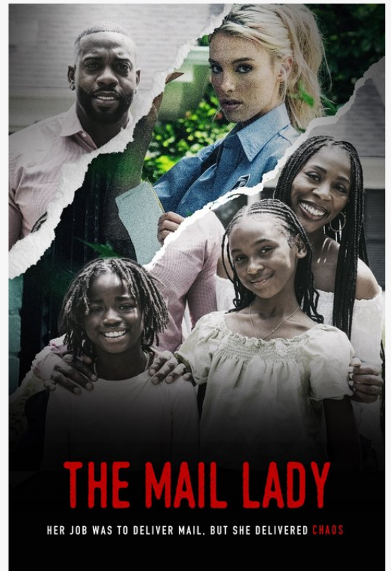
The Mail Lady, Paris Films