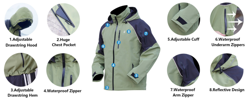
Reflective Waterproof Jackets from RANDY SUN