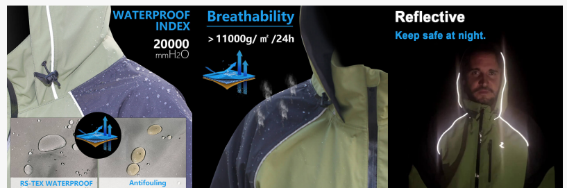
RANDY SUN Waterproof Windbreaker Feature