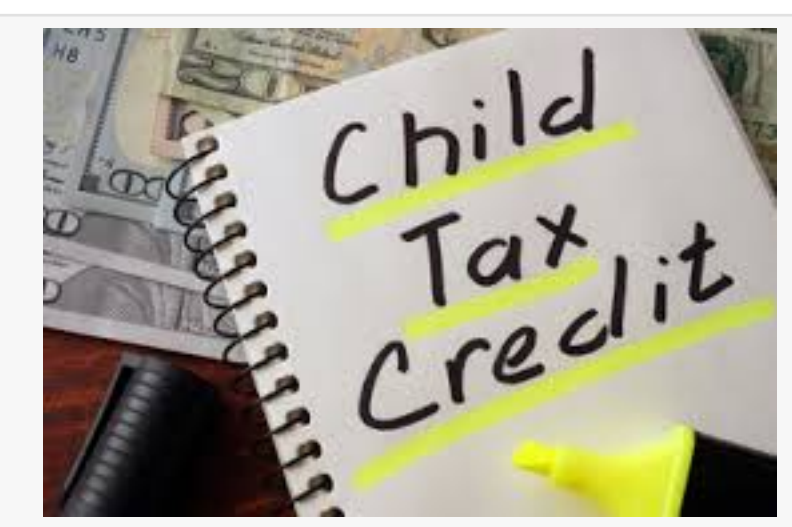
Child Tax Credit

taxpayers must first determine if they are eligible. Eligibility is based on several factors, including the number of qualifying children, age, and income. To qualify, a family must have at least one child under the age of 18 who is a U.S. citizen or resident alien.