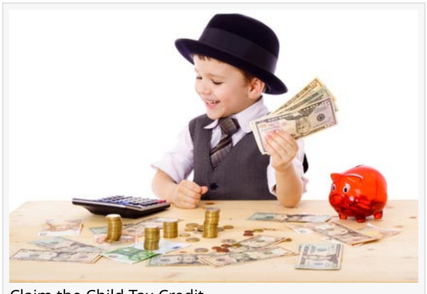
Claim the Child Tax Credit

Taxpayers must also provide information about their income and other deductions to determine the amount of the credit they are eligible to receive.