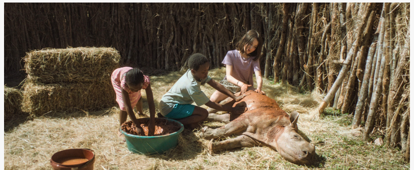
Thabo and Emma Take Care of a Baby Rhino