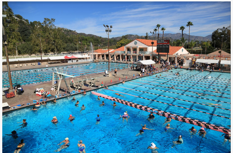
Rose Bowl Aquatics Center image of pool