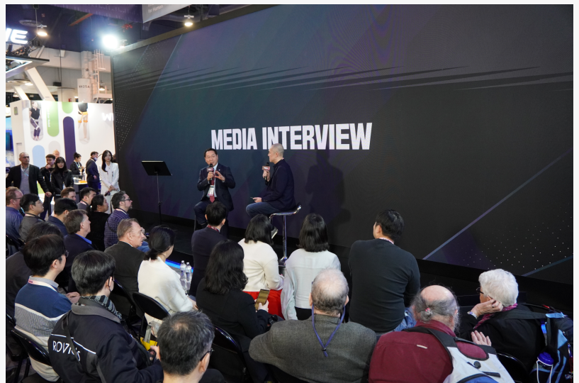
Global media outlets attended the media session hosted by the Incheon Free Economic Zone Authority.