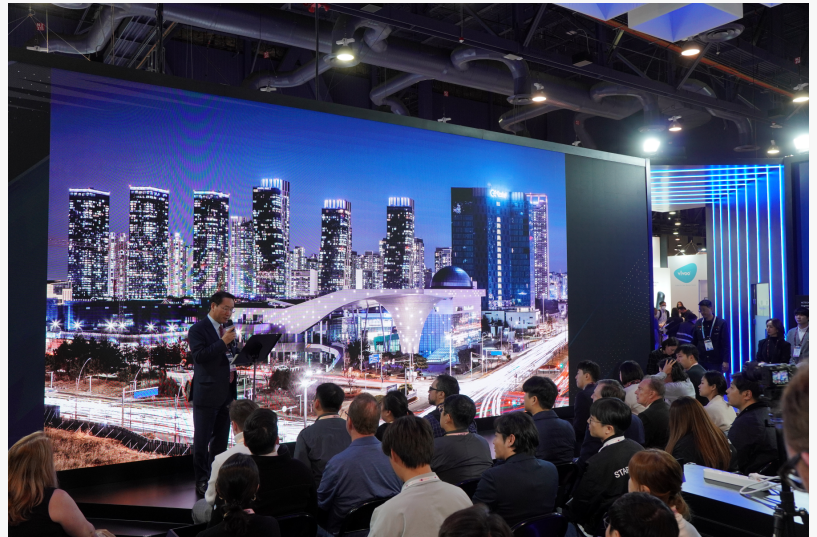
Incheon Mayor Yoo Jeong-bok is pictured on January 9th (local time) presenting the future vision of Incheon's smart city at the Incheon·IFEZ promotion hall, located in the Artificial Intelligence (AI)·Robot zone within the North Hall of the Las Vegas Convention Center.

Making its first appearance at CES, Incheon presented 'Light up the Future with Smart AI·Robot Solutions' under the theme of utilizing AI-based services and innovative technologies developed