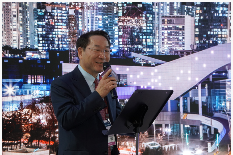
Incheon Mayor Yoo Jeong-bok presenting on Incheon's smart city in front of the international media.

Incheon further promoted its future vision and showcased innovative technologies of participating companies globally through the 'Incheon Media Stage,' which was attended by media from the United States and other countries. Mayor Yoo conducted a presentation session on Incheon's future vision and startup excellence and participated in interviews with companies at the Incheon·IFEZ promotion hall.