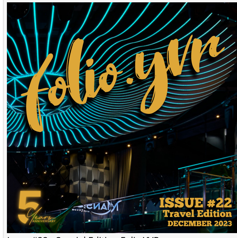
Issue #22 - Special Edition Folio.YVR

continue to present the world with an even larger perspective on Canada's third largest city, after Toronto and Montreal. With a curated database of over 35,000 persons and an affiliate distribution program, this advertising-free magazine of sponsored content garners support from the city's upper echelons of business, hospitality, finance, philanthropy, and entertainment.