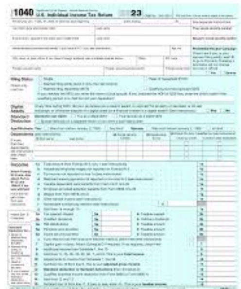
Printable IRS Tax Forms

This press release can be viewed online at: https://www.einpresswire.com/article/680609079 EIN Presswire's priority is source transparency. We do not allow opaque clients, and our editors try to be careful about weeding out false and misleading content. As a user, if you see something we have missed, please do bring it to our attention. Your help is welcome. EIN Presswire, Everyone's Internet News Presswire™, tries to define some of the boundaries that are reasonable in today's world. Please see our Editorial Guidelines for more information.