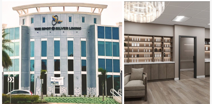
Our New Location in Windermere

At Exclusive Med Aesthetics & Hair Restoration, they are passionate about helping clients look and feel their best. The new Windermere location will offer the same exceptional services and treatments that their clients have come to know and love, including hair restoration, medical aesthetics, and wellness services. Exclusive Med Aesthetics & Hair Restorations team of highly trained and experienced professionals will be on hand to provide complimentary consultations and answer any questions anyone may have.