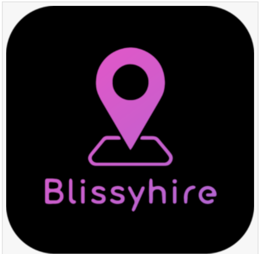
Blissyhire - Connecting Beauty Professionals and Clients

The app's key features include a streamlined search function, direct communication between professionals and clients, detailed professional profiles, and secure payment options. The app is available for download in Spanish and English on both IOS and Android platforms.