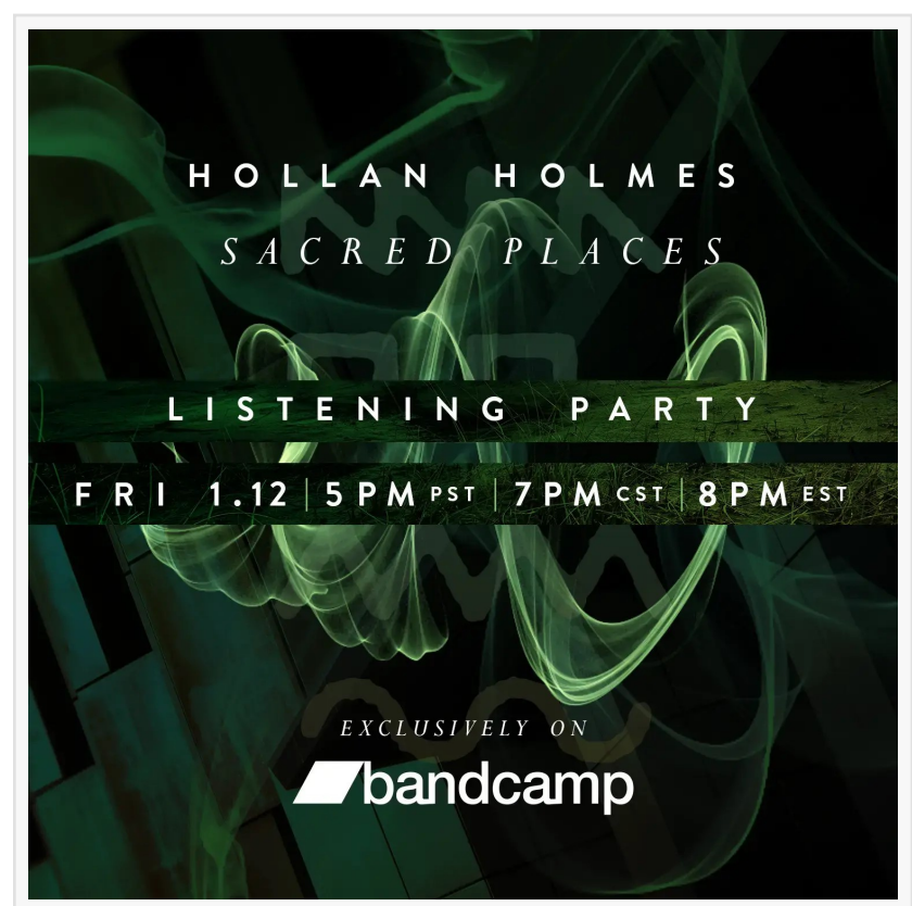
Spotted Peccary Hosts a Listening Party for Hollan Holmes on Friday 1/12/24 at Bandcamp

Spotted Peccary will host Hollan Holmes in a live <u>Bandcamp Listening</u> <u>Party</u> on release day, January 12, 2024 at 5 pm PST / 8 pm EST for music journalists and fans on the platform. RSVP at: <a href="https://hollan-holmes.bandcamp.com/merch/hollan-holmes-sacred-places-listening-party">https://hollan-holmes-sacred-places-listening-party</a>