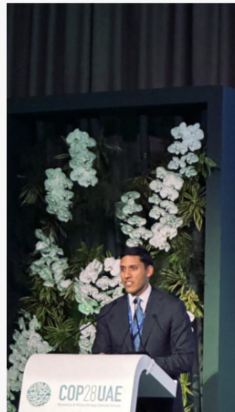
Dr. Rajiv J. Shah President of the Rockefeller Foundation at COP28