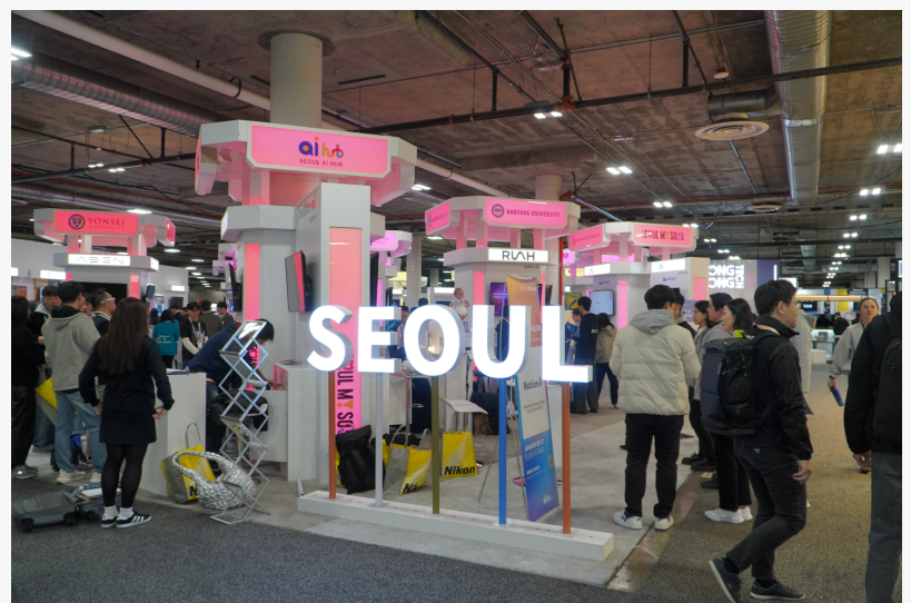
The Seoul sign at the 'Seoul Pavilion' at CES 2024

The Consumer Technology Association (CTA) established the CES Innovation Awards in 1976 to honor innovative products and new technologies for their technical, aesthetic, and creative qualities. Global company executives and industry experts respect the CES Innovation Awards as