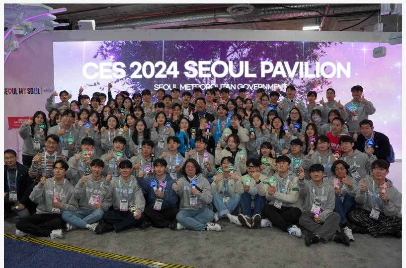
Mayor Oh Se-hoon took a commemorative photo with companies from the Seoul Pavilion at the opening ceremony of 'CES 2024' in Las Vegas on January 9th, 10 a.m. local time.

DNA Corporation: Solutions based on genetic analysis technology