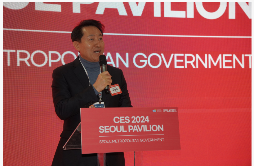
Mayor Oh Se-hoon gave an opening speech to start the first day of the Seoul Pavilion.