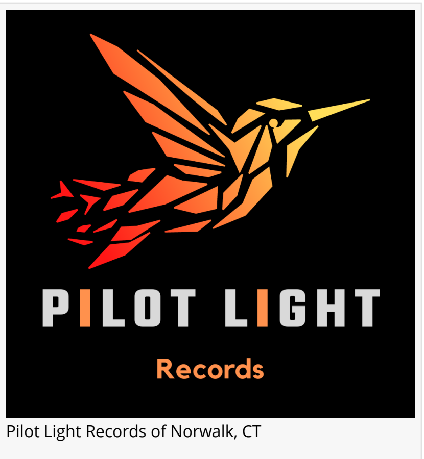
Pilot Light Records of Norwalk, CT

This press release can be viewed online at: https://www.einpresswire.com/article/680709567