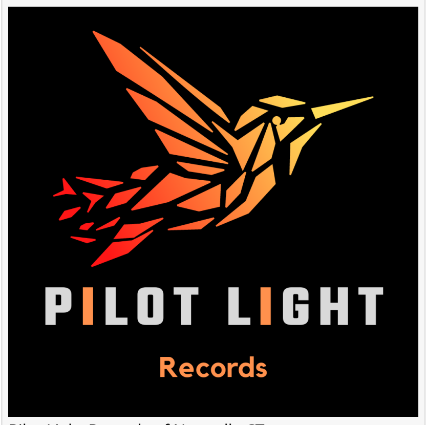
Pilot Light Records of Norwalk, CT