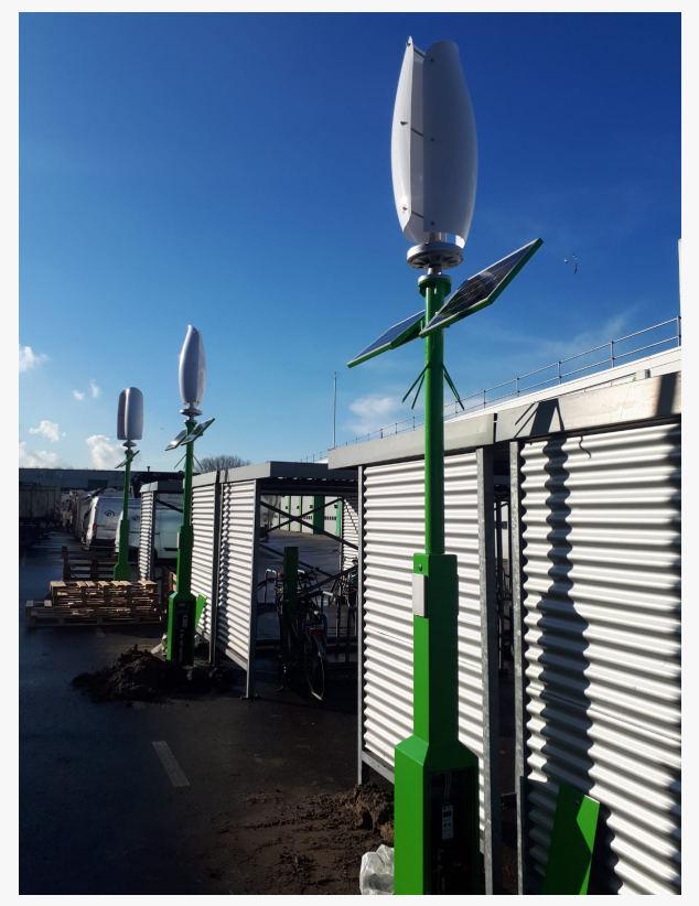
Wind and Solar E-bike Charging Poles

Flower Turbines has external validation as a top company: