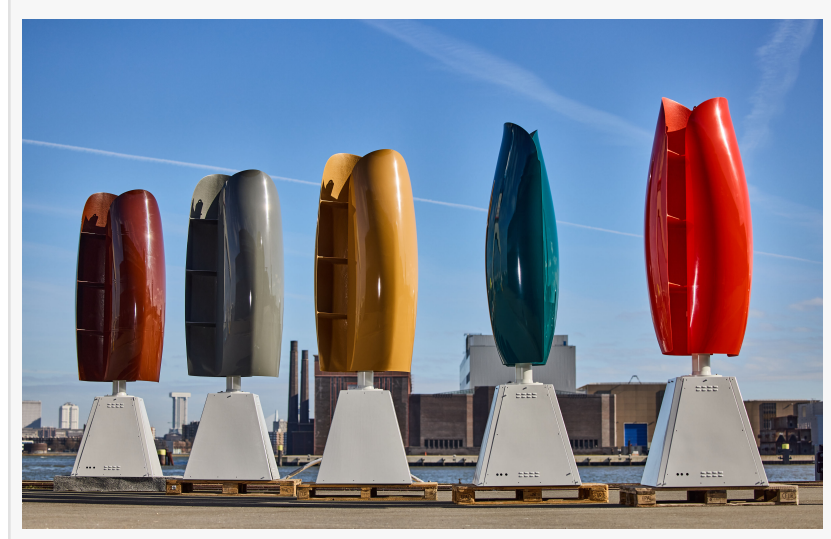
Bouquet of Wind Tulip Turbines