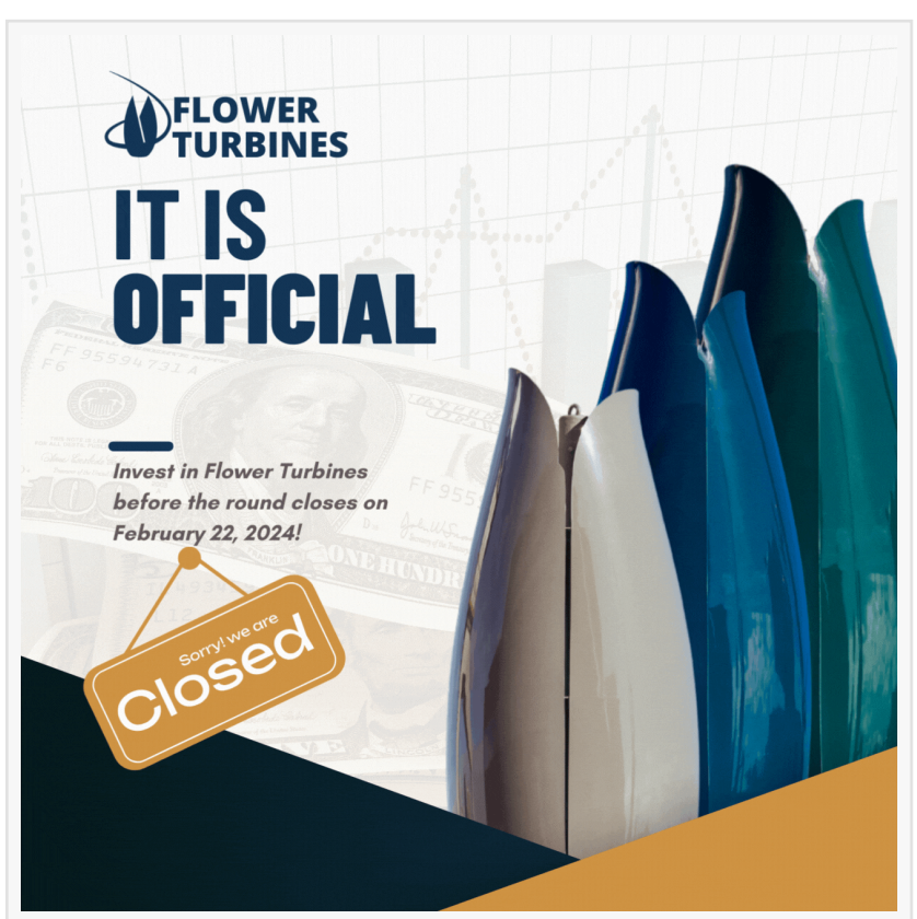
40 Days Till Flower Turbines Round Closes

Flower Turbines' small-scale, aesthetically pleasing wind turbines are designed to start at low wind speeds, thrive in high winds, and actually boost each other's performance when