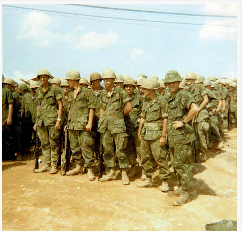
Fox Company, 2nd Battalion, 5th Marines on Hill 65 for Marine Corps Birthday celebration 10 Nov 1969

This press release can be viewed online at: https://www.einpresswire.com/article/680753595