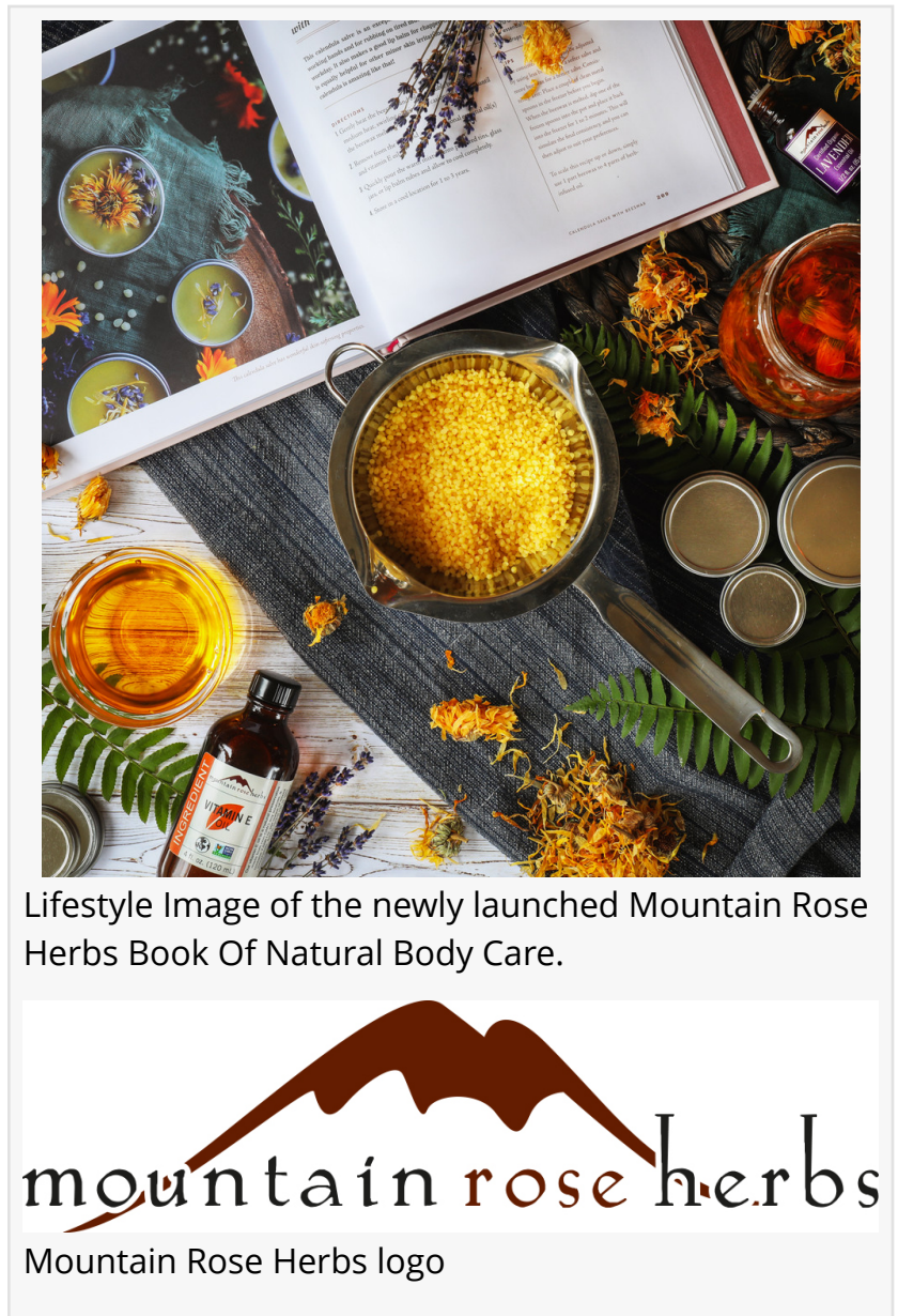
Lifestyle Image of the newly launched Mountain Rose Herbs Book Of Natural Body Care.