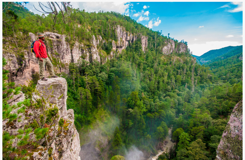
The 2024 Eclipse from Durango in the most beautiful Natural Setting