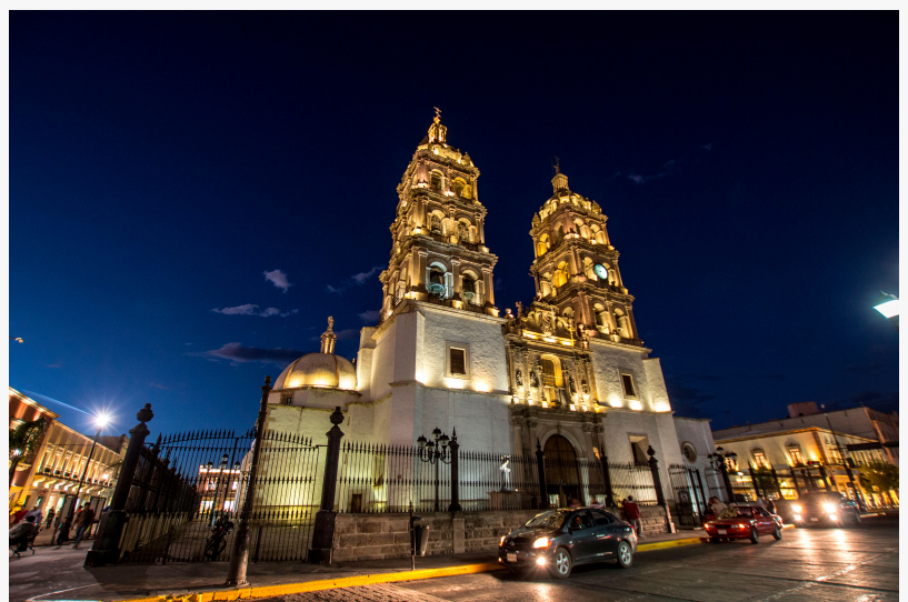
Fall in Love with Durango, Mexico's, Charming History