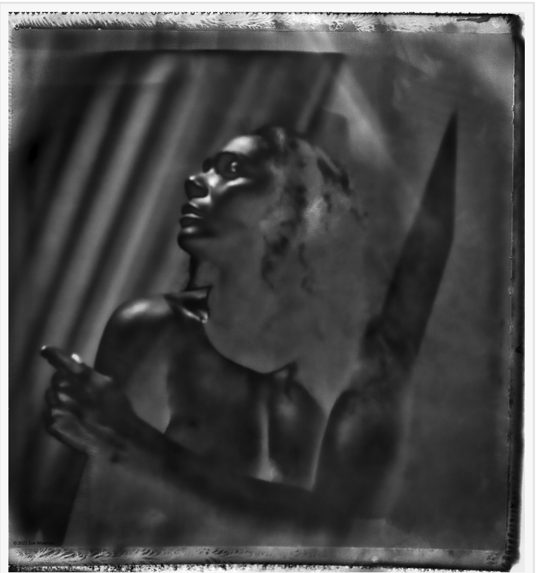
Merrique #172 for Sunkissed 85 by Zoe Wiseman

Sunkissed 85 is a limited edition invitation to journey through light and shadow, where the boundaries of reality are fluid, and every photograph is a window into the extraordinary. This collection of "crimes against photography" celebrates the art form's potential to escape the ordinary and invite the viewer