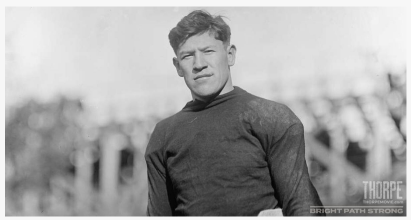
NFL Legend The Great Jim Thorpe

Athletes in Action NFL Sanctioned Super Bowl Breakfast 2024 Featuring The Bart Starr Award