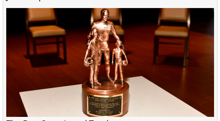
The Bart Starr Award Trophy

Group. "We are deeply committed to celebrating both Bart Starr and Jim Thorpe's remarkable legacies and showcasing it to the world. Our goal is to not only honor the phenomenal legacy of Jim Thorpe but also strengthen our bonds with Tribal Nations and unify communities around the world."