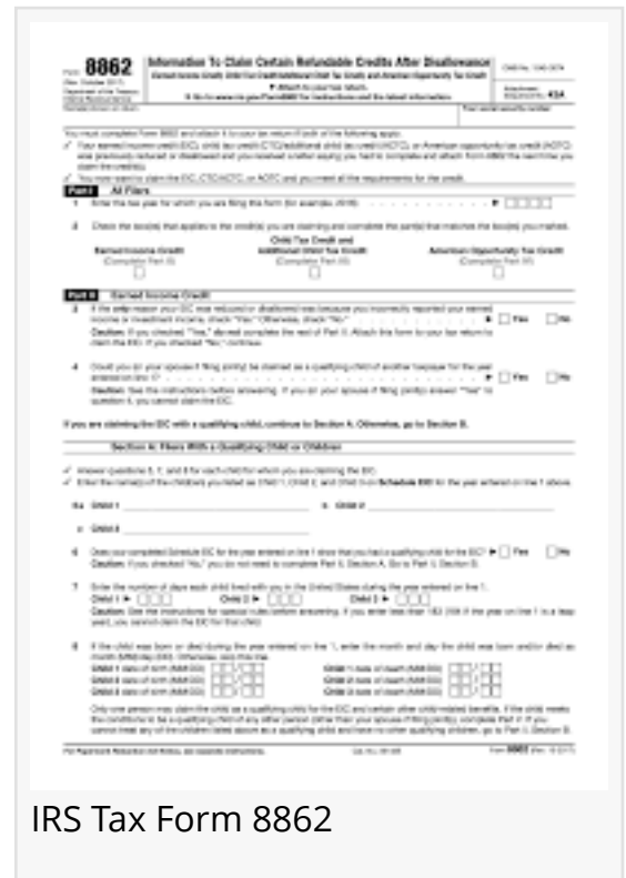
IRS Tax Form 8862

The release of the new form and instructions is part of the IRS's ongoing effort to improve tax