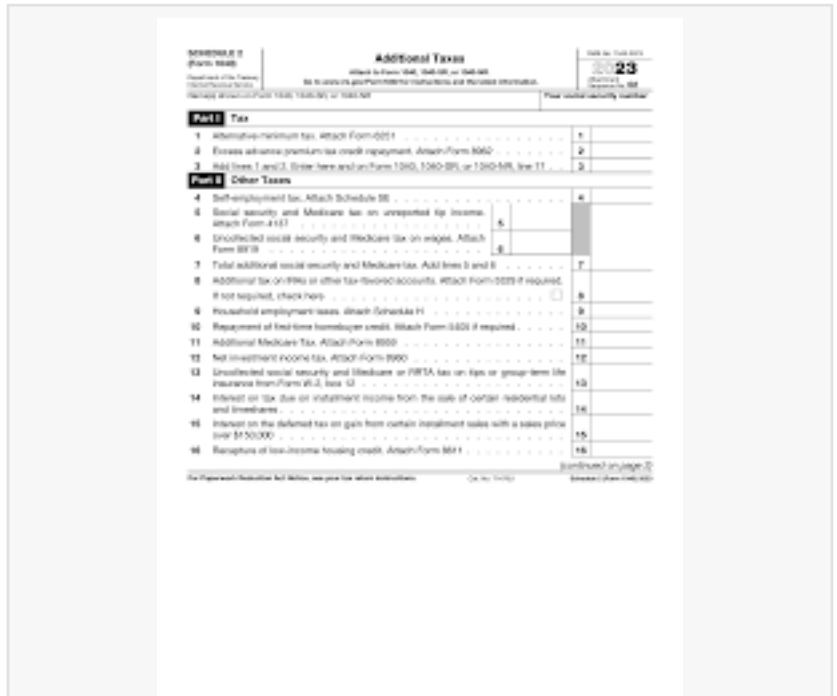
IRS Schedule 2 Tax Form

In addition, the IRS has updated the instructions to provide clarity on how to calculate the alternative minimum tax and how to report it on the Schedule 2 form. Taxpayers are encouraged to carefully review the updated instructions to ensure accurate reporting and avoid potential penalties.