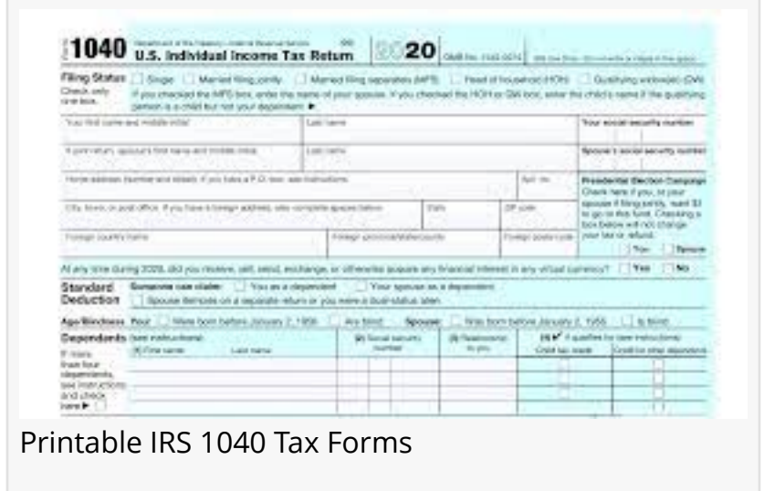
Printable IRS 1040 Tax Forms