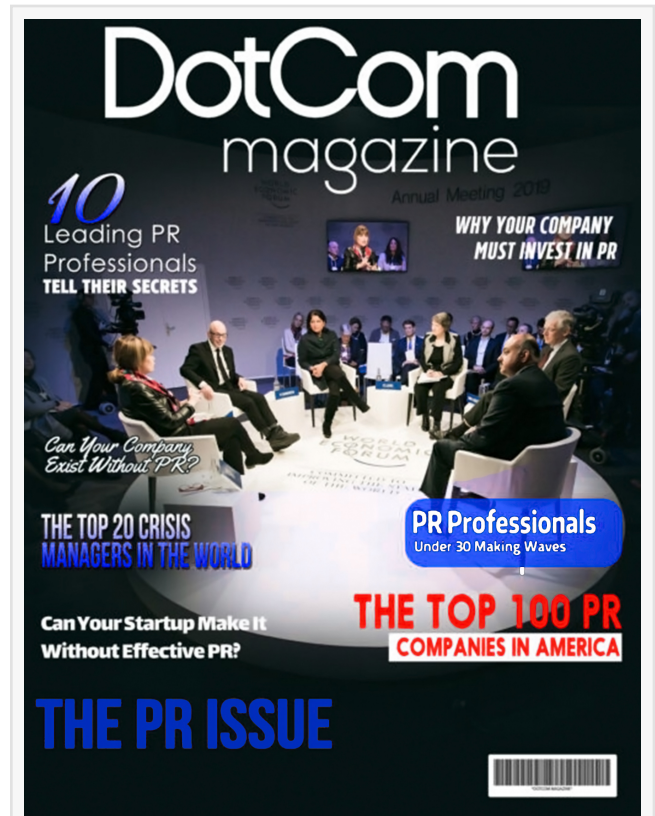
The DotCom Magazine Entrepreneur Spotlight Series-The Power Of Video

This press release can be viewed online at: https://www.einpresswire.com/article/681087809