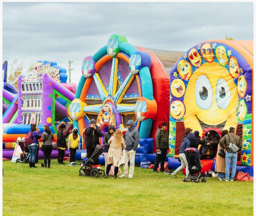
Superior Events Group Has. A Massive Selection Of Inflatable Event Rentals