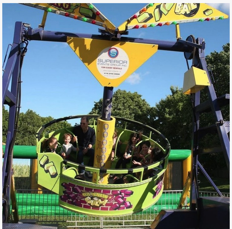
Your Source For Amusement Ride Rentals In Toronto, CA - Superior Events Group

As Toronto's leading event rentals provider, Superior Events Group invites event planners, corporations, and individuals to explore their extensive offerings. With their commitment to innovation, quality, and customer satisfaction, they are poised to continue leading the way in creating memorable and successful events in Toronto.