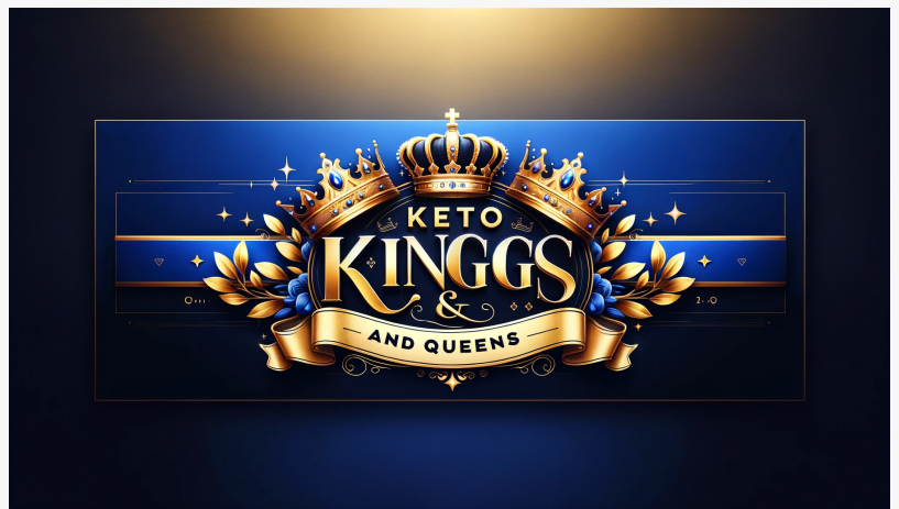
a banner made for the keto kings and queens facebook group.