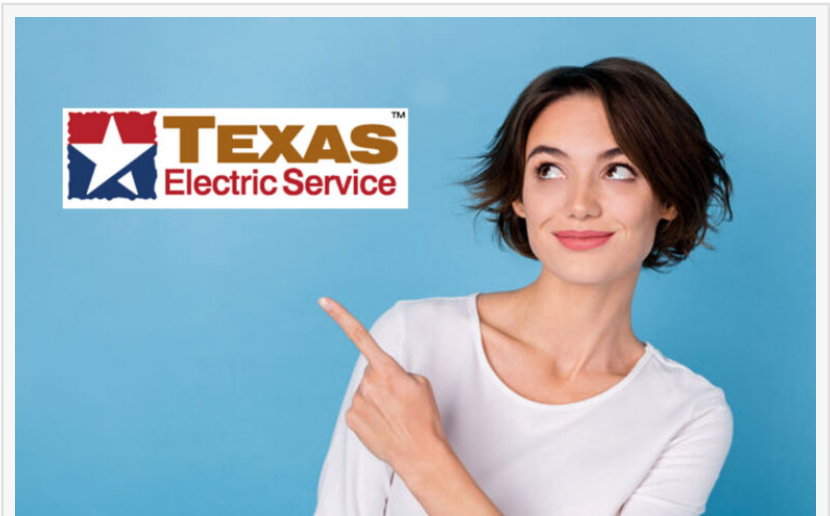
Power In 1 to 3 Hours

For more information visit: https://texaselectricservice.com/